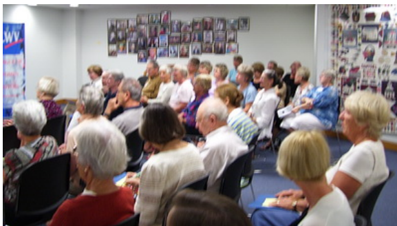
The first meeting of the Sanibel MAL unit of the League.